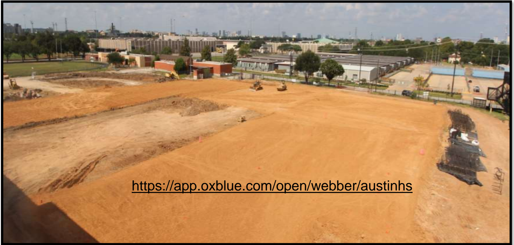
Photo from Ox Blue camera mounted on roof of 1936 Building.

https://app.oxblue.com/open/webber/austinhhs